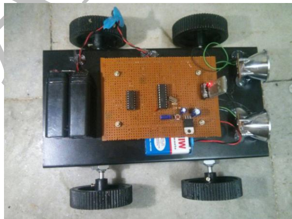
Figure 1.3: Android phone Bluetooth controller ROBOT/ROBO