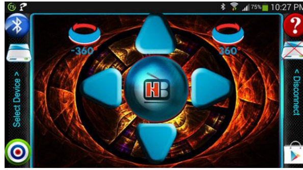
Figure 1.2: Android Application Controlling Vehicle.